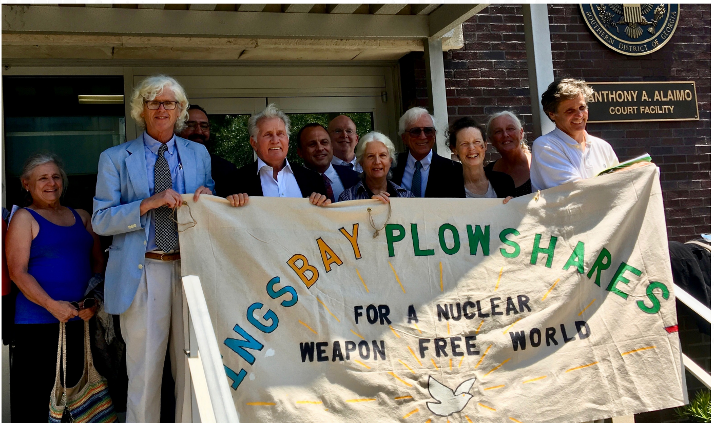
Members of the Kings Bay Plowshares and supporters outside a federal courthouse.

The “Kings Bay Plowshares Seven,” as they came to be known, were arrested and charged with conspiracy, trespass, destruction of property, and “depredation” of property. 221