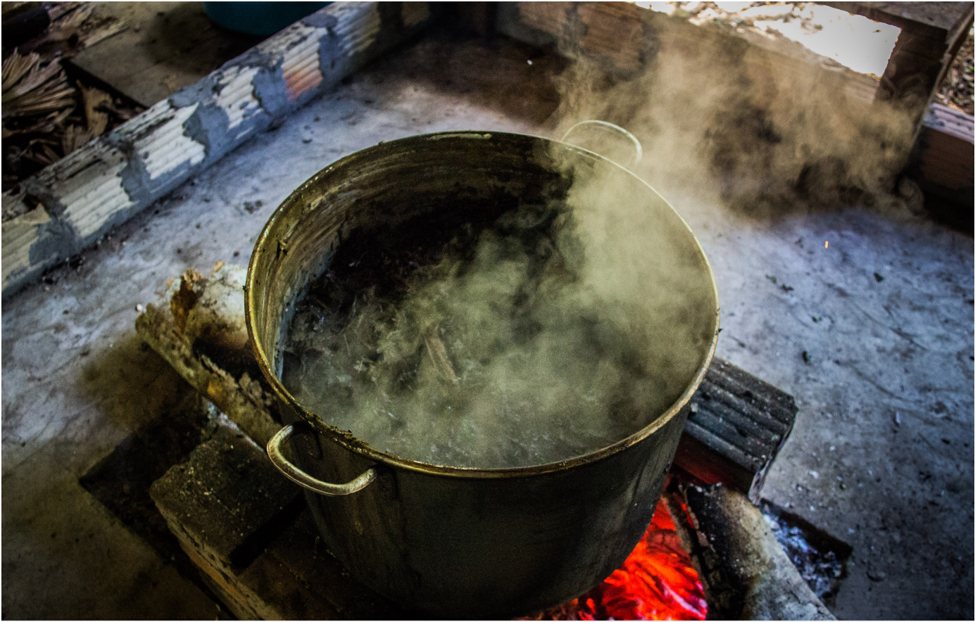
Hoasca brewing.

“The communion with Hoasca creates an enhanced state of consciousness, capable of amplifying one’s perception of his/her essentially spiritual nature, bringing about positive development in the moral and intellectual aspects of a human being.”